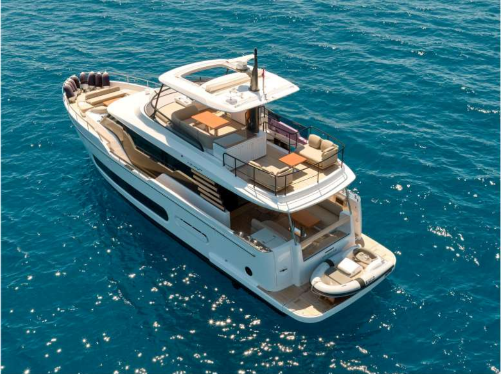
2025 Azimut Magellano 60 EXTERIOR